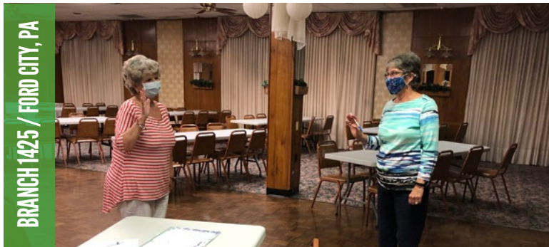
August Branch Officers meeting.