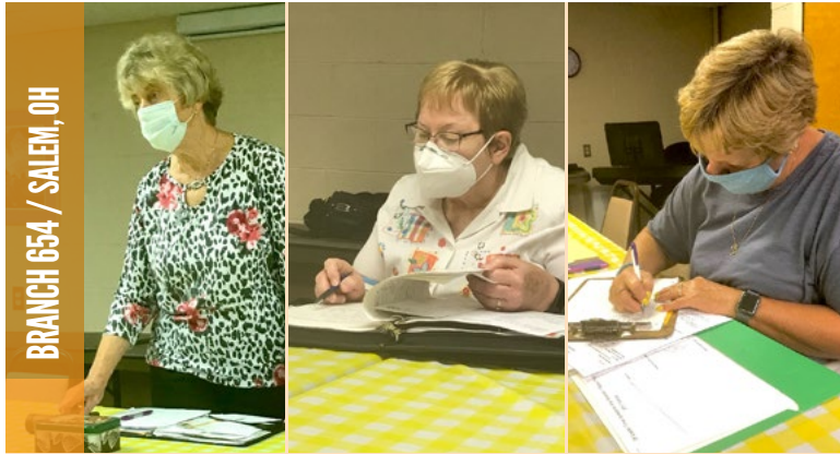
August Branch meeting.