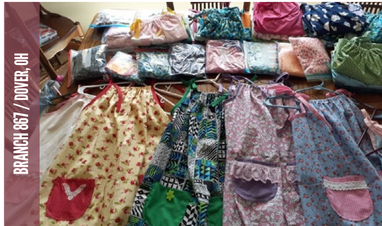
Branch 867 has been busy making more dresses to send to Dress a Girl with Hope , a non-profit that provides dresses to girls around the world. They've also been making adult bibs and walker bags.