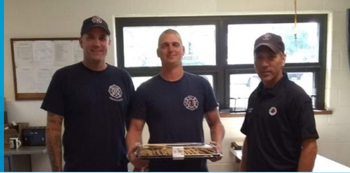
Branch 49 delivered trays of cookies to local Erie firefighters.