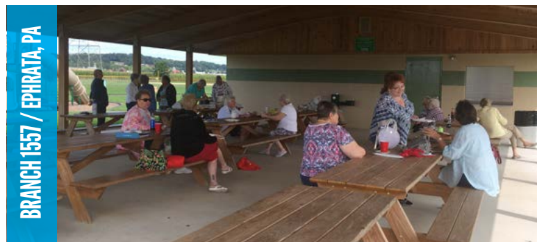
Branch 1557 held their branch meeting outdoors on a warm September day.