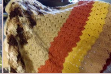
More lappans made and donated by Branch 867.