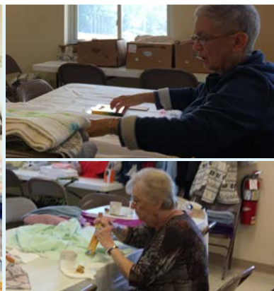
Branch members regularly trace, cut, and sew patterns for sanitary pads which are then distributed to impoverished countries.