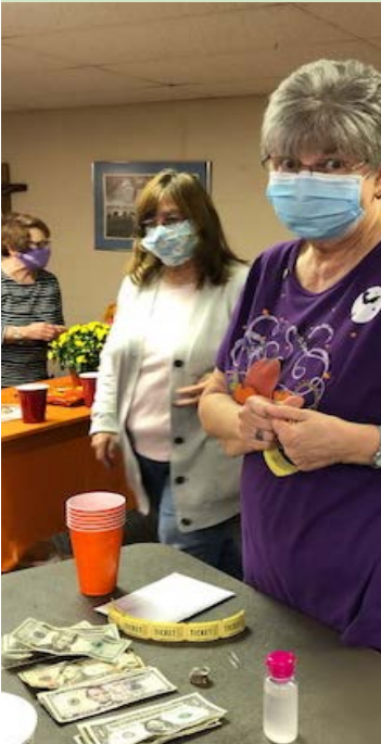
October Branch meeting including a Pound Party and the collection of paper products and personal hygiene items for the Christina Home for women.