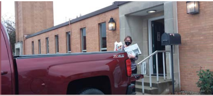
Branch 867 donated paper products to the local homeless shelter.