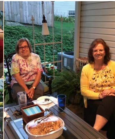
September Branch meeting.