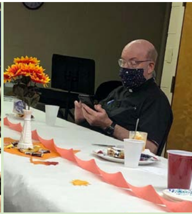
September Branch meeting.