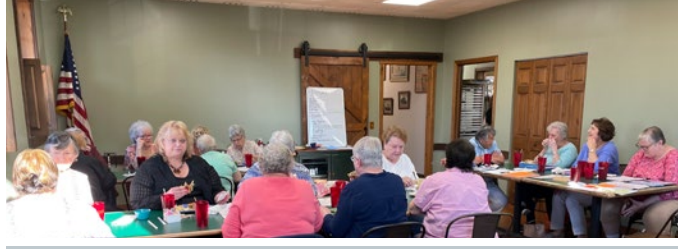
May Branch Meeting