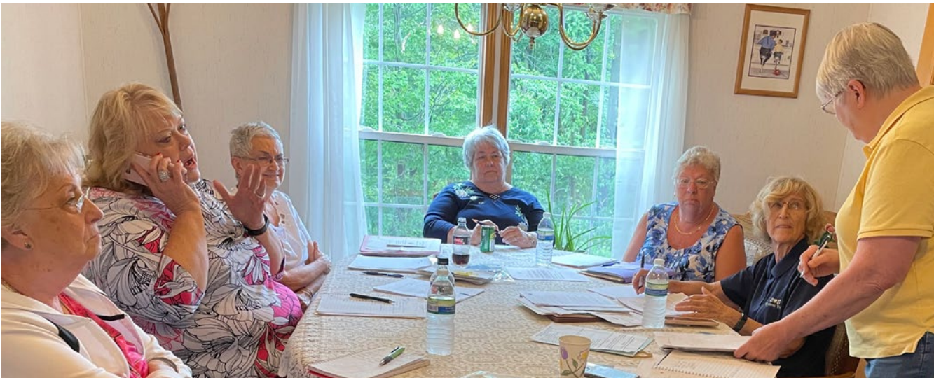
Members of Branch 1557 met to discuss preparations for a BINGO fundraiser, to be held on July 18.