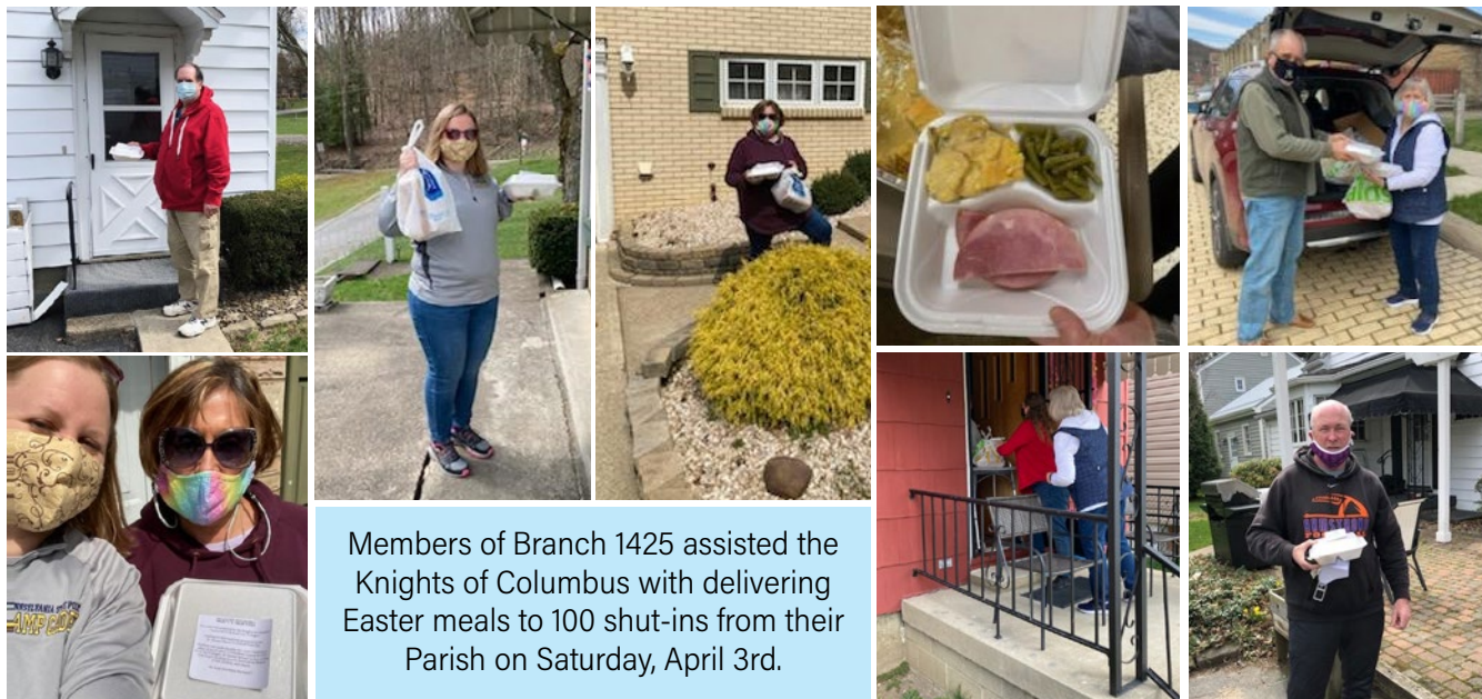
Members of Branch 1425 assisted the Knights of Columbus with delivering Easter meals to 100 shut-ins from their Parish on Saturday, April 3rd.