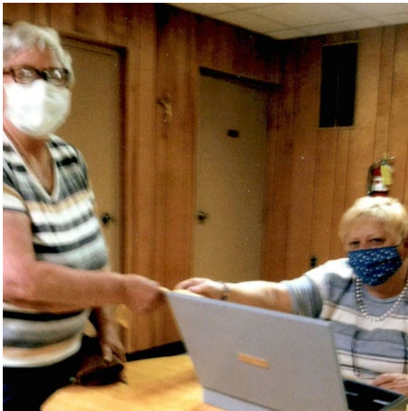
Selling tickets for a basket raffle.