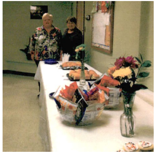
First Reconciliation Luncheon.