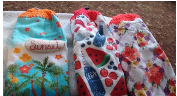
Handmade towels to be sold at fundraisers.