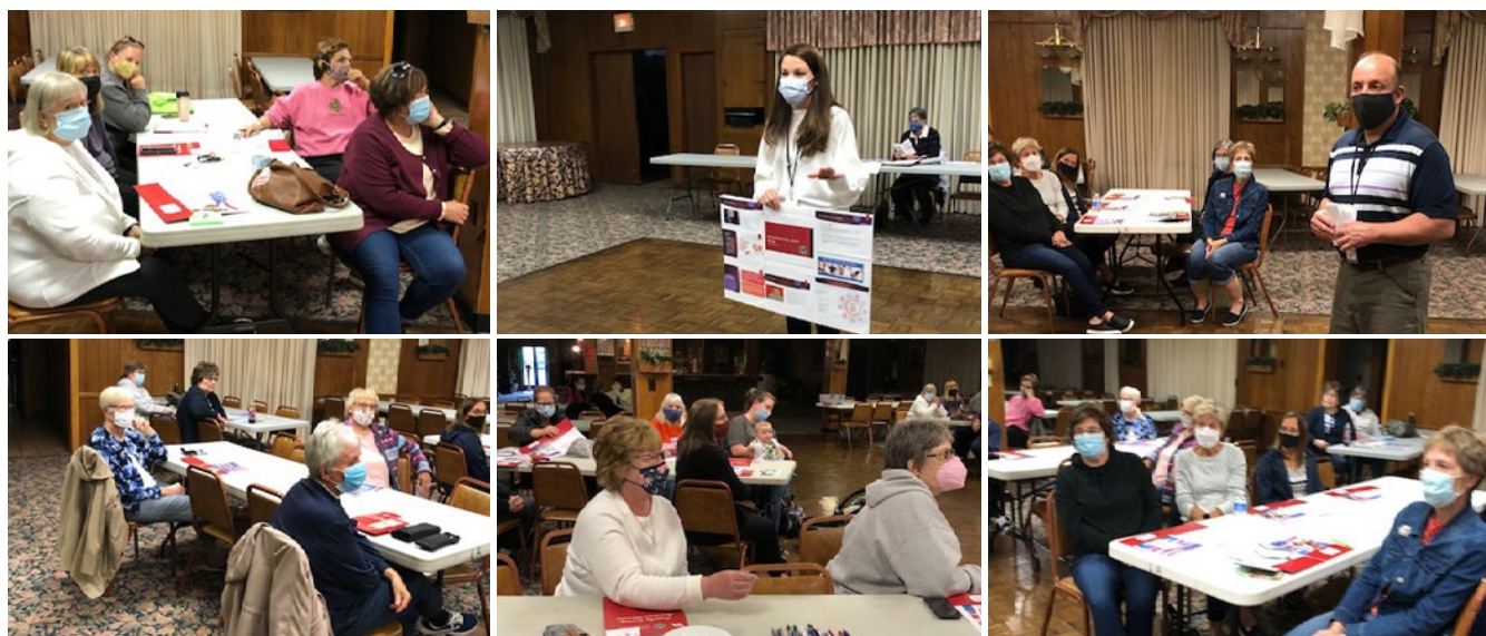
May Branch Meeting with two guest Federal speakers.