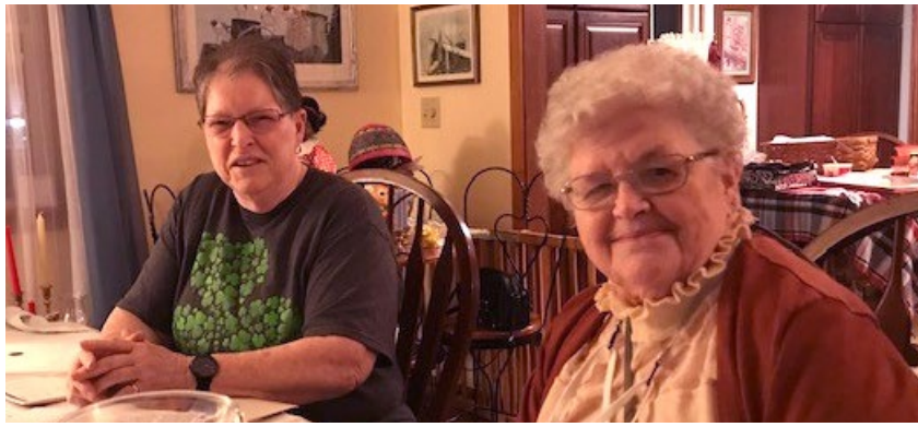
March Branch Meeting