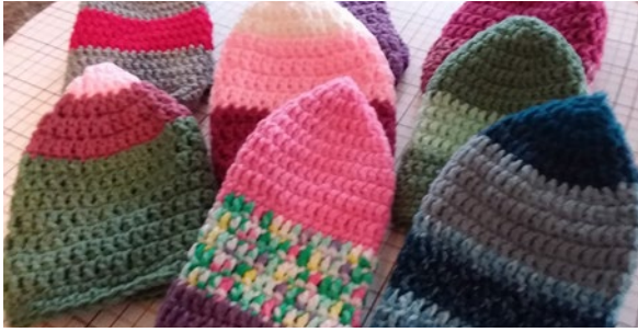
Branch members are making 50 warm hats to contribute to the Knights of Columbus fall coat donations.