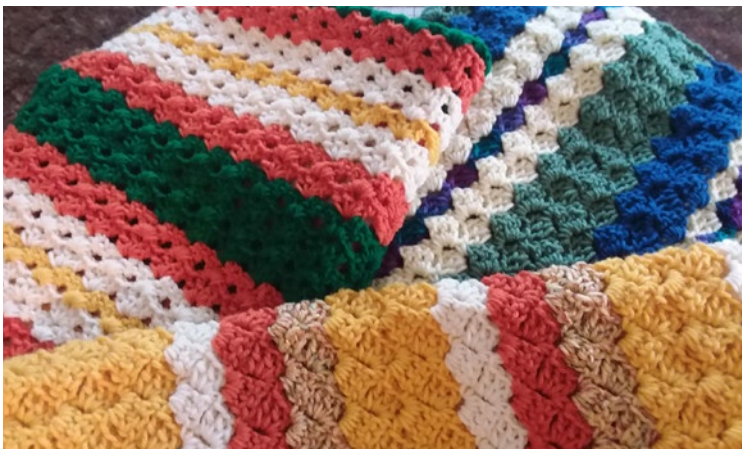
The members of Branch 867 are still busy making lappans to donate to the local VFW for veterans.