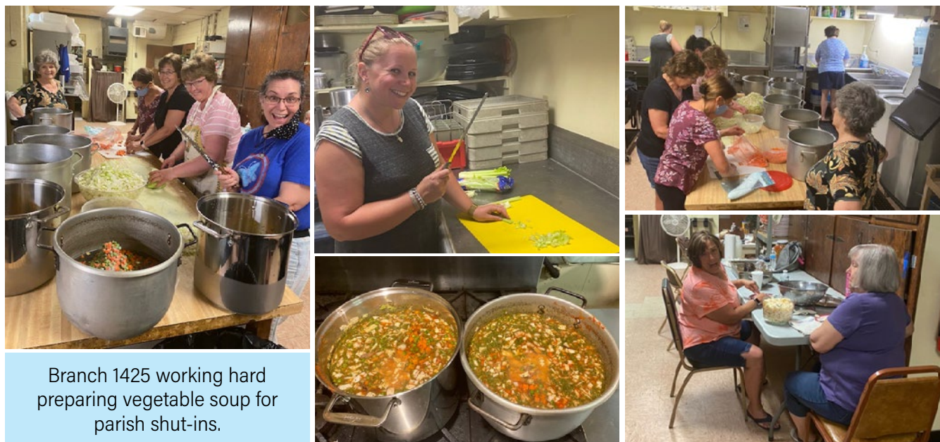
Branch 1425 working hard preparing vegetable soup for parish shut-ins.