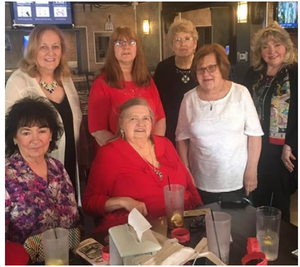
BRANCH 49 / Erie, PA

Visit www.lcbalife.org to find a complete list of our Branches.