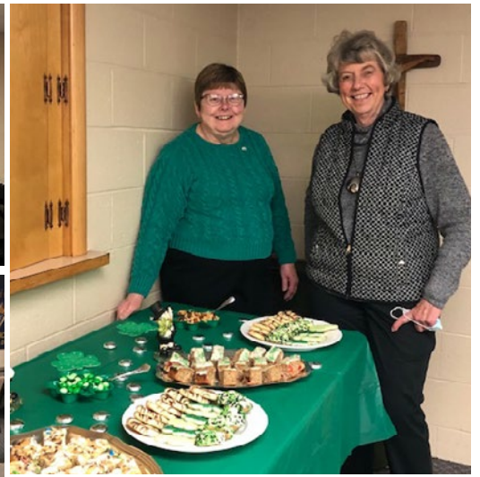
March Branch Meeting