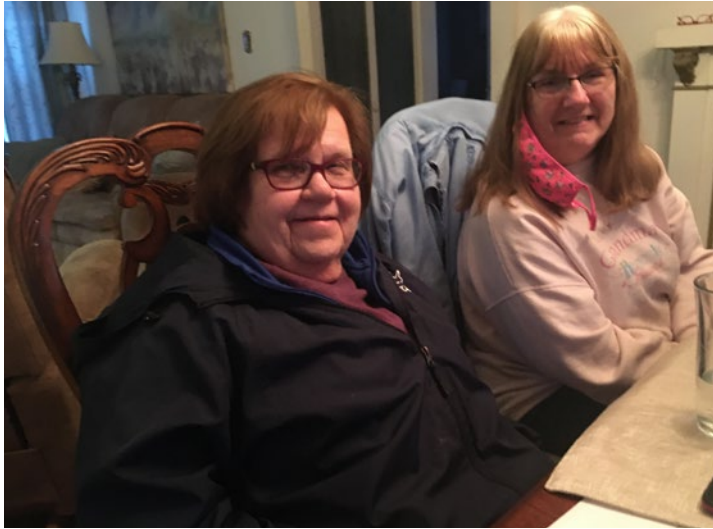
March Branch Meeting