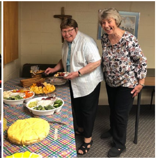
April Branch Meeting