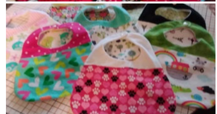
Branch members made bibs to sell at the St. Joseph Festival.