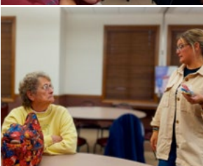
Hats, socks, and gloves that the Branch recently collected were displayed at the November Branch meeting that featured a guest speaker.