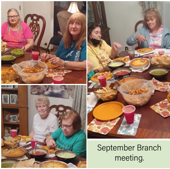
September Branch meeting.