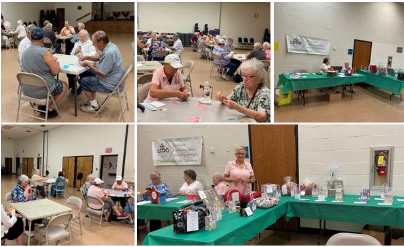
Branch members prepared and donated food, and volunteered their time to make sure their card party was a success. In addition to the card games there were raffles and a 50/50 drawing!