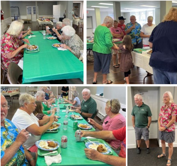
Branch summer picnic.