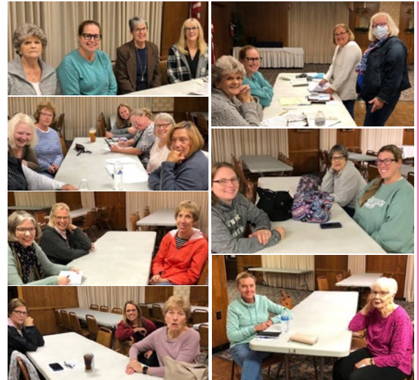
November Branch meeting.