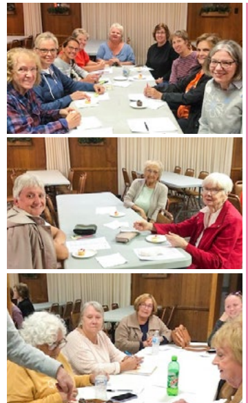
October Branch meeting.