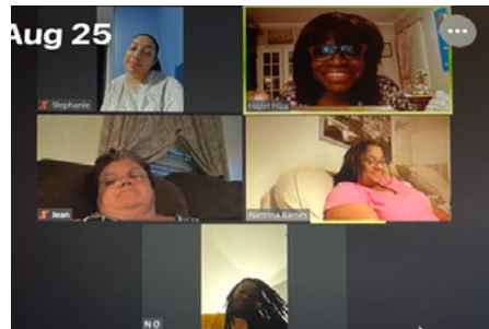
August Branch meetings.