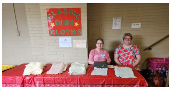
Dishcloth sale at the Bazaar at St. Michael's Church.