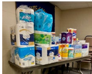
October Branch Meeting highlighted by paper products donated by members for the Christina House.