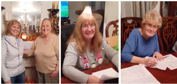
November Branch meeting.