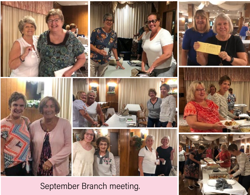
September Branch meeting.