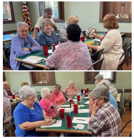
September Branch meeting.