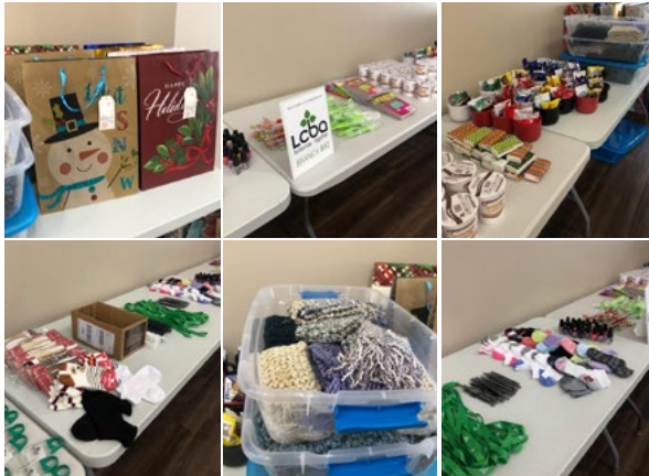
Branch members put together Christmas gift bags for Harbor House and River Glen.