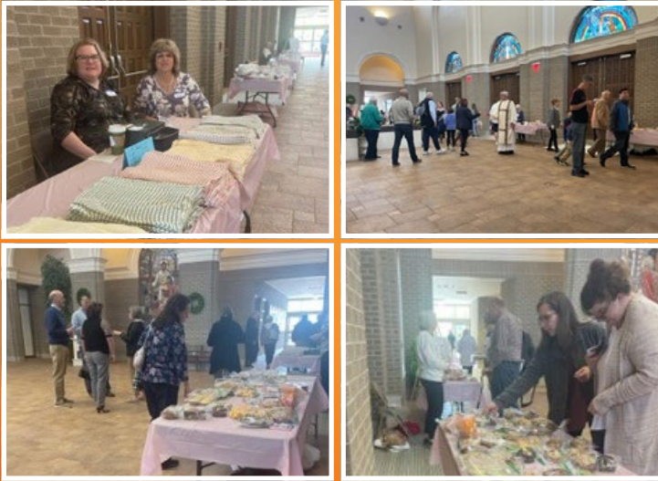
April Bake Sale.