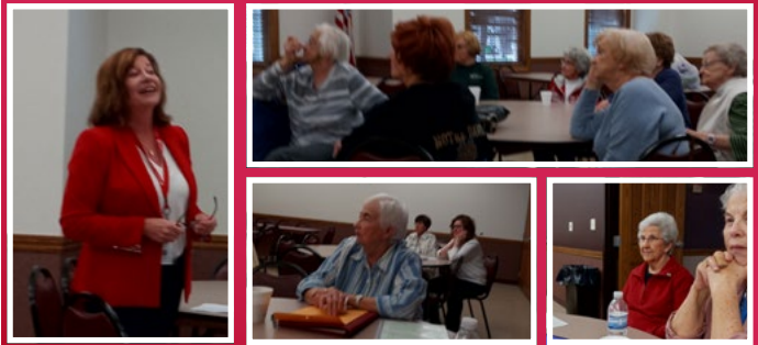
April Branch meeting.