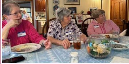
BRANCH 1155 / Findlay, OH September Branch meeting with a guest from Habitat for Humanity.