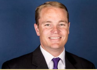
Chair of the Board of Directors